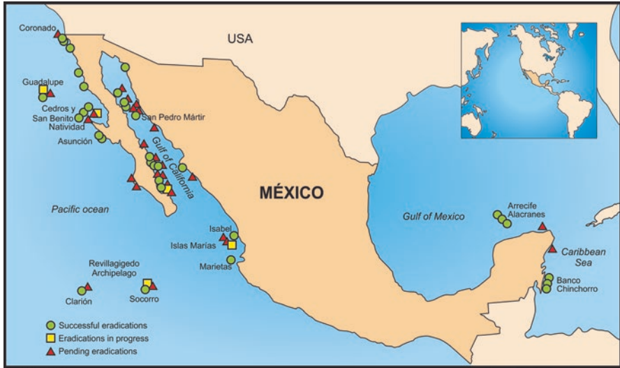
Fig. 9.1 Successful, in progress, and pending invasive mammal population eradications in the Mexican islands, up to April 2018